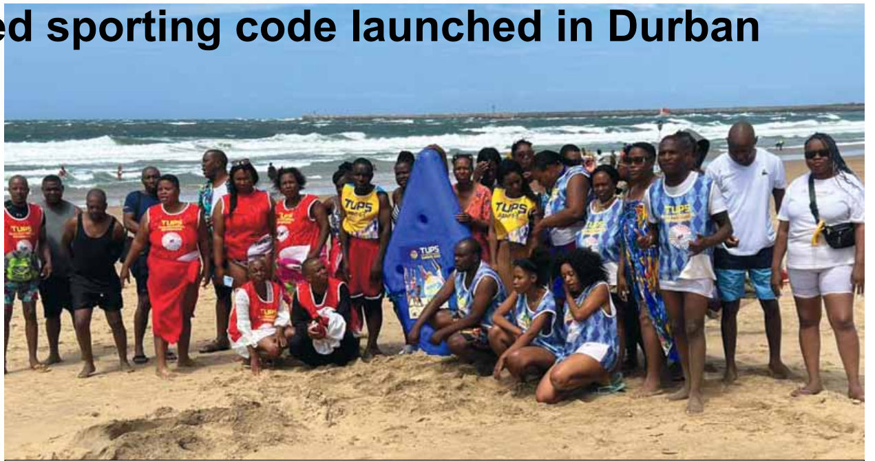
Sekhukhune invented TUPS Sport players just after the first-ever TUPS Beach Edition activation at the Durban Beach Front in eThekweni Metropolitan Municipality.