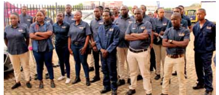
Laduma Staff ready to serve at the New Store in Dennilton