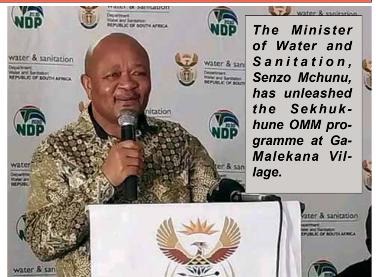
The Minister of Water and Sanitation, Senzo Mchunu, has unleashed the Sekhukhune OMM programme at Ga-Malekana Village.