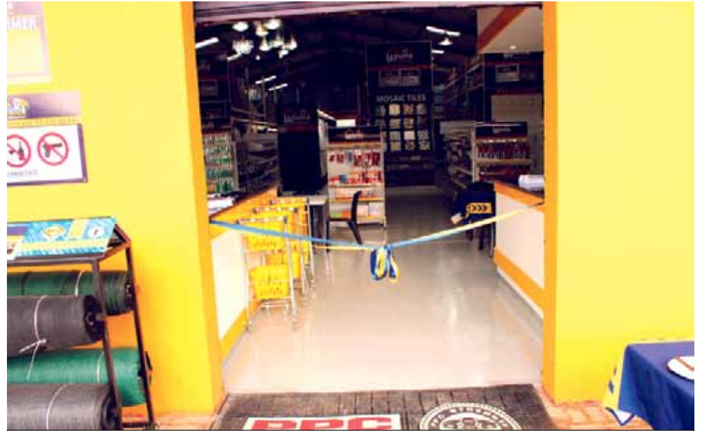
All set for the Ribbon Cutting of the New LADuma Hardware Store in Dennilton

CCA Poles, steel products, fencing materials and many more. The ample space with compartmentalised sections allows for items to be neatly packed. It also allows for deliveries from Suppliers and dispatches to customers to be run swiftly, all aimed at delivering superior customer experience. As Laduma Hardware is proud to contribute towards alleviating the Community's challenges of high unemployment and also of making building materials easier and cheaper to access through our brand-new store in Dennilton.