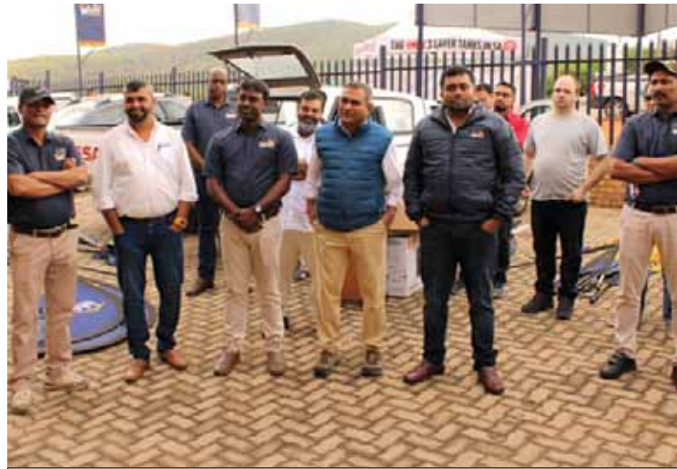
Executive Management ready to launch the new Laduma Hardware store in Dennilton

Laduma Hardware perpetually raises the bar in so far as bringing its stores in proximity to its customers and also in extending its geographic footprint. Yet another store has been launched on the 24 th October 2022 in Dennilton. The new store boasts of 1000 square metres floor space that caters for all building needs under one roof. It caters for a wide range of building materials to help you renovate your home with ease. It is even more suitable for customers that are building from scratch, needing bricks, cement, steel reinforcement etc for their foundation, right through to walls, brick force, doors and windows with their frames ( steel or aluminium), lintols, electrical materials, plumbing materials and roofing materials. It also caters for building materials that give a house a podium finish - tiles, paint, lights, columns, header and footer, garage doors etc. Laduma Hardware Dennilton is bringing a wide range of quality building materials at affordable prices